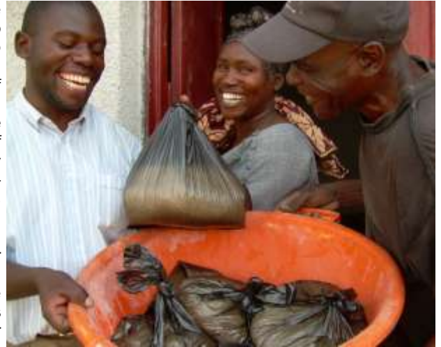
Heal Africa Staff and Volunteers help with food distribution.

Today we, and several of the HEALing Arts Mamas, walked to each room and gave the food to victims of: rape, burn, gunshot and knife wounds, and other patients of all kinds. They sang and smiled wide as they received the food! The stories are endless. One mother of six whose home was invaded by FARDC soldiers in a poor neighborhood of Goma. The soldiers demanded all her money, and when they discovered that she had none, they stabbed her in the chest near the heart. This mother is pregnant. She has been at the hospital since October 29 th , the day of the attacks in Goma, and her mother is her caretaker. Her face shows decades of suffering accentuated by the recent anguish of trying to find food for her suffering daughter. Although the young mama lost weight at the beginning, she is slowly starting to regain strength and is very happy that her baby was not affected by the knife wound. People like this vulnerable mother have now received enough food to get them through the next several days. Currently, we have around 300 patients at the hospital. The few days surrounding the